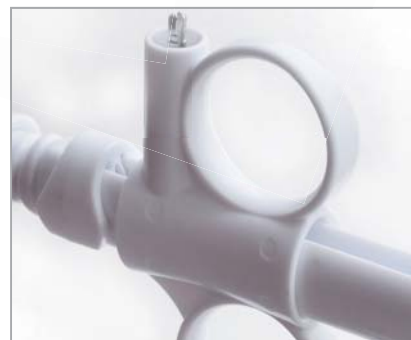
3-ring handle with power connection